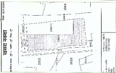
KHASARA PLAN SCALE 1:400